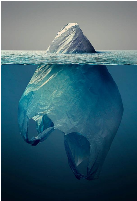
Artwork by Jorge Gamboa https://kottke.org/18/05/plastic-iceberg

Check out these advertisements and discuss how and if they are effective in the message they are trying to spread. Create your own poster, promoting conservation of our oceans or reducing plastic use!