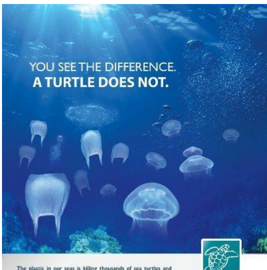
World Turtle Day campaign https://www.medasset.org